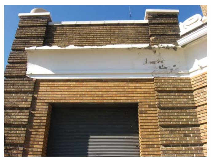
Ledge over east garage door.

Project Location and Images Madison Golf Course Concrete Ledge Restoration March 10, 2015